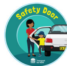
Kids and Traffic Safety Door sticker RTA45091021K