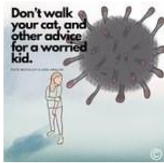
Don't Walk Your Cat & Other Advice for a Worried Kid

Free children friendly ebooks available to download (Click on book title or book cover)