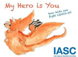
My Hero is You