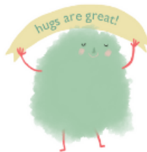
Many Ways to Share a Hug